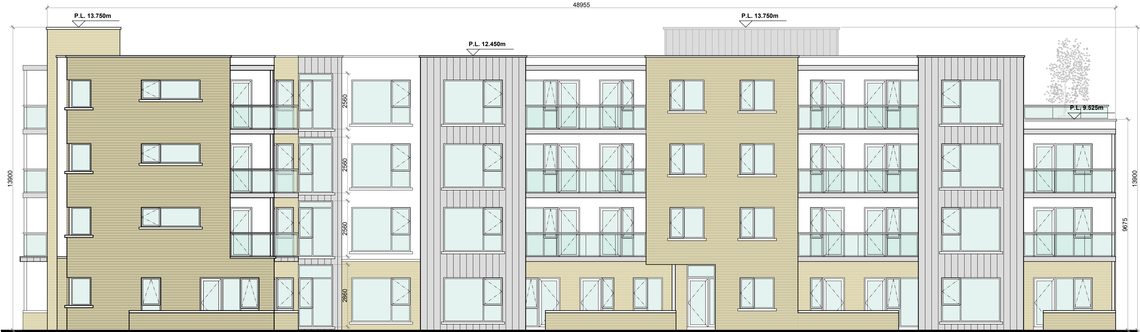
BLOCK 'C' (SOUTH-WEST) ELEVATION @ 1:100