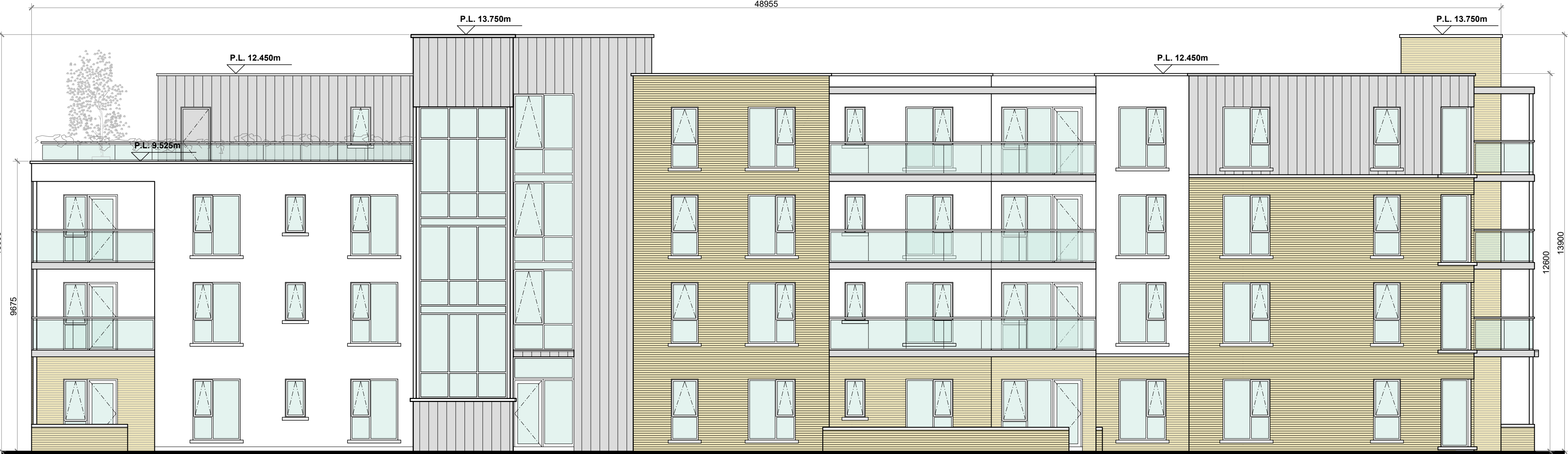
BLOCK 'C' (NORTH-EAST) ELEVATION @ 1:100