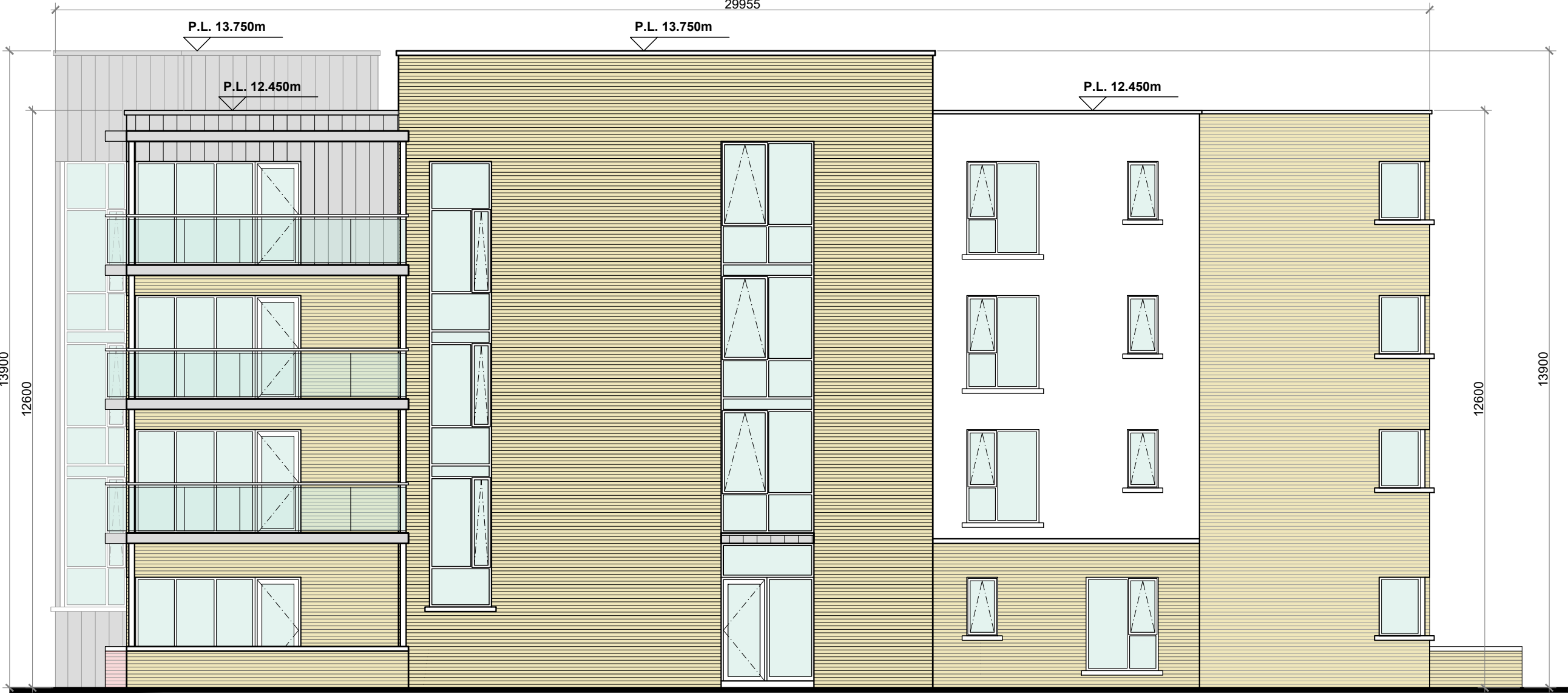
BLOCK 'C' (NORTH-WEST) ELEVATION @ 1:100